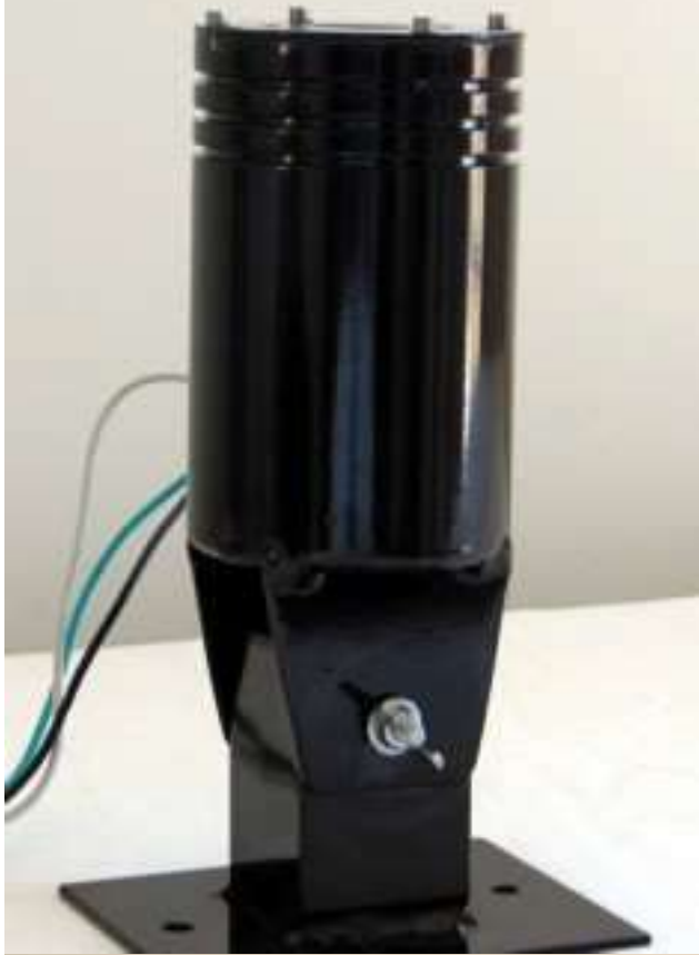
PALM TREE LED 6.6 WATT